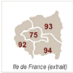
Ile de France (extrait)